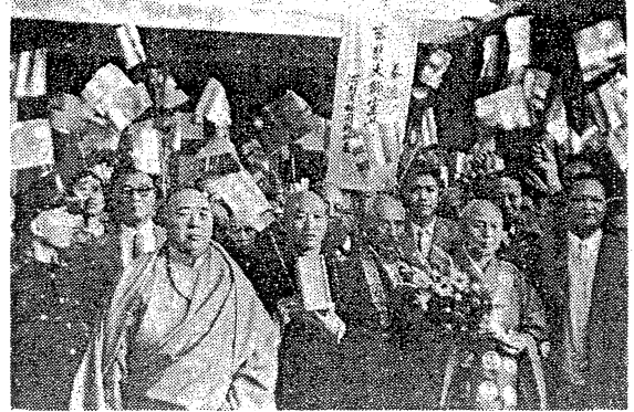
The grand greeting at the air port.